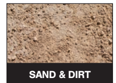
SAND & DIRT